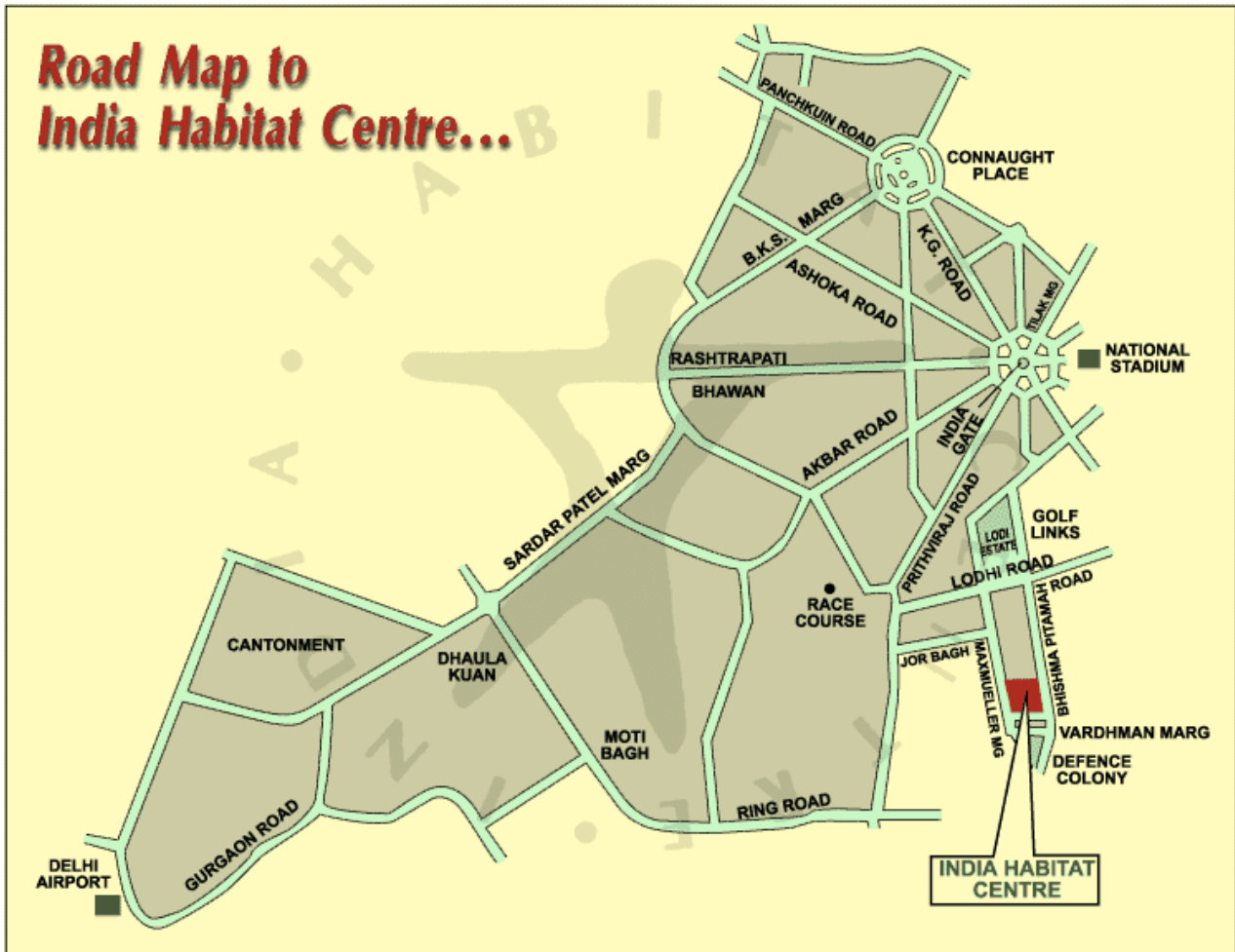
Map of the Habitat Centre